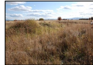
Before-After New Willow Channel